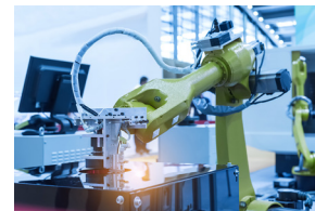
Machine Vision systems