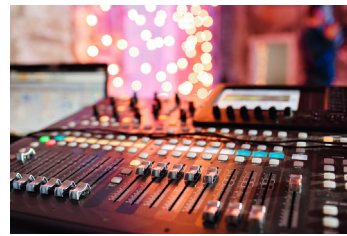
Mixers or Routers