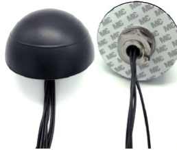
AEACBK110053-MLWG External MIMO Antenna GPS/GLONASS + LTE MIMO + WiFi MIMO