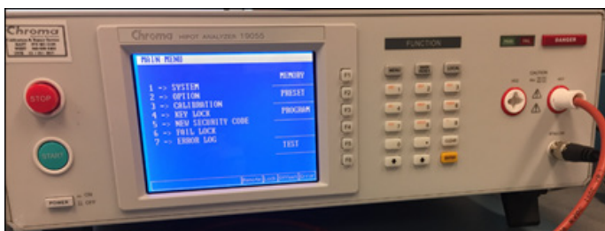
[Figure 2, Hi-Pot Analyzer]

In order to verify the Breakdown voltage of an inductor, a HI-POT Analyzer is utilized to perform this test.