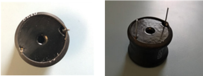
[Figure 1, epoxy coated AIRD inductor]

To overcome this challenge, Abracon's AIRD series inductors utilize a specialized epoxy coating on the surface of the core.