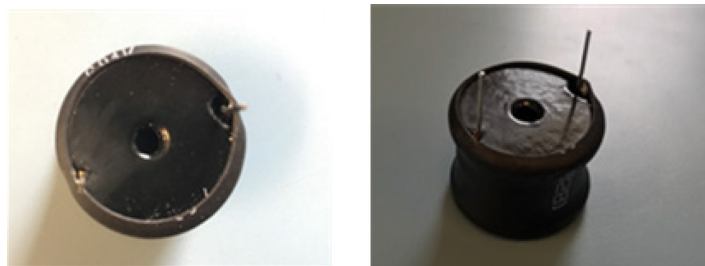
Figure 1: Epoxy Coated AIRD Inductor

To overcome this challenge, Abracon’s AIRD series inductors utilize a specialized epoxy coating on the surface of the core.