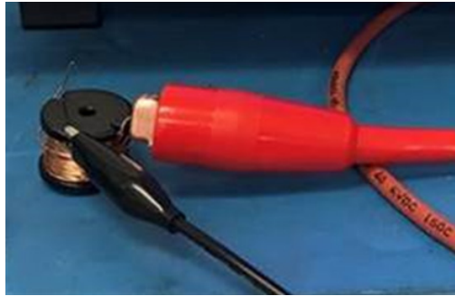
Figure 3: AIRD Inductor Breakdown Voltage Test (Tube Removed for Testing)