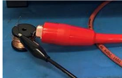
[Figure 3, AIRD inductor Breakdown voltage test (tube removed for testing)]