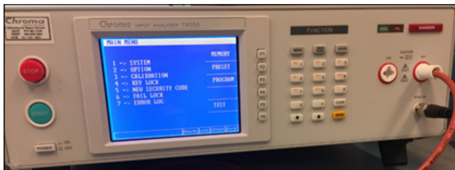
Figure 2: Hi-Pot Analyzer

In order to verify the Breakdown voltage of an inductor, a HI-POT Analyzer is utilized to perform this test.