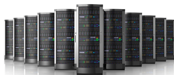
IoT and data center management