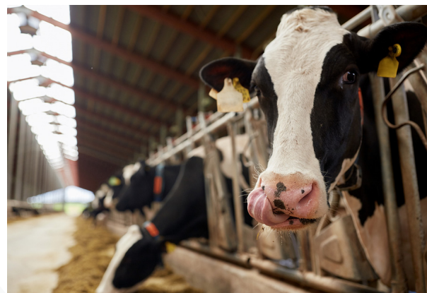
Livestock and agriculture tracking