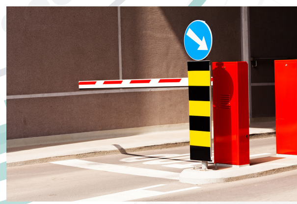
Access control: entrance and exit