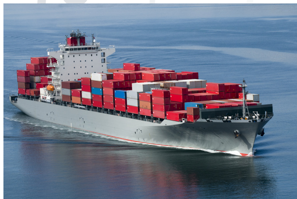
Asset tracking of metal objects: containers, tools equipment, machinery

Additional Applications: Transportation, trains, airplanes, Access control—parking garages, tolls, Harsh environments, and more.